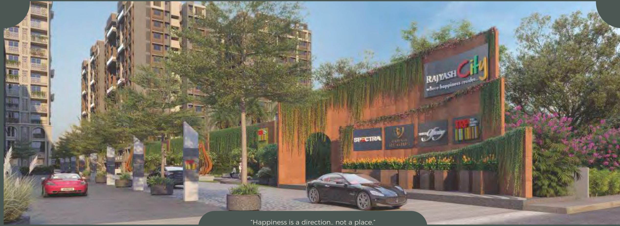
"Happiness is a direction.. not a place." A Happy Street that directs you to your Kingdom!