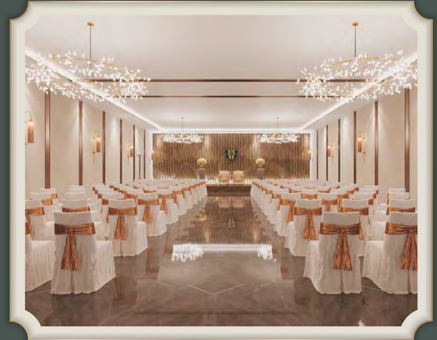
A Strikingly studded reception & banquet fit to welcome the Royalty.