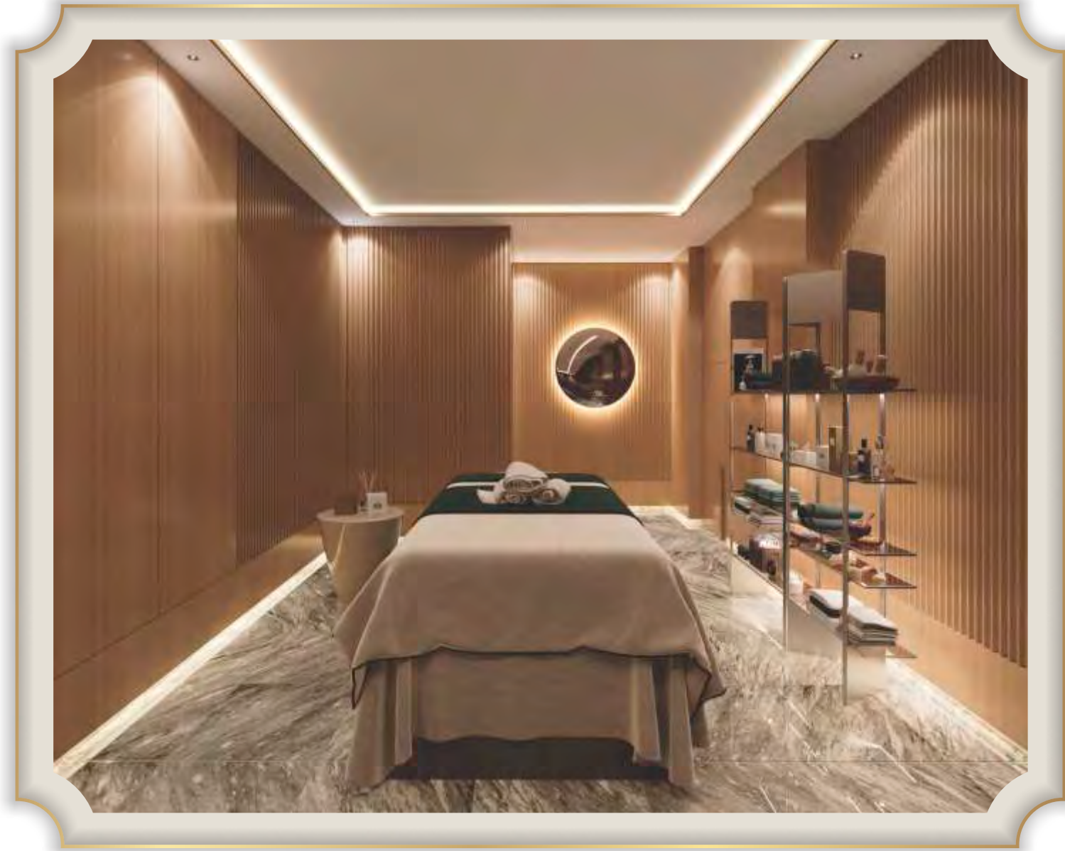
An in-house Spa and In-door weather controlled Swimming pool - amenities coveted even by the Royals!