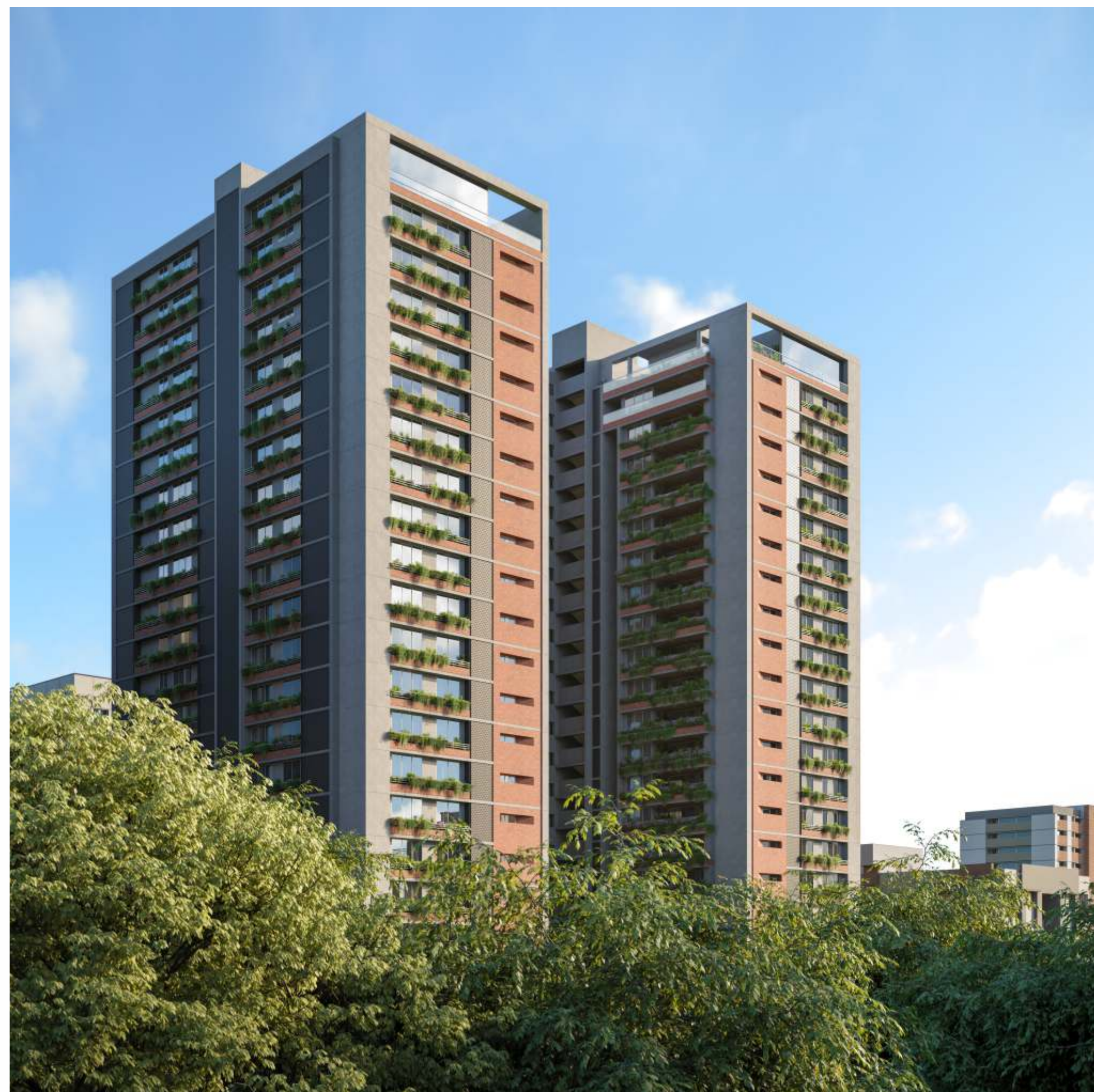
* Artistic Impression