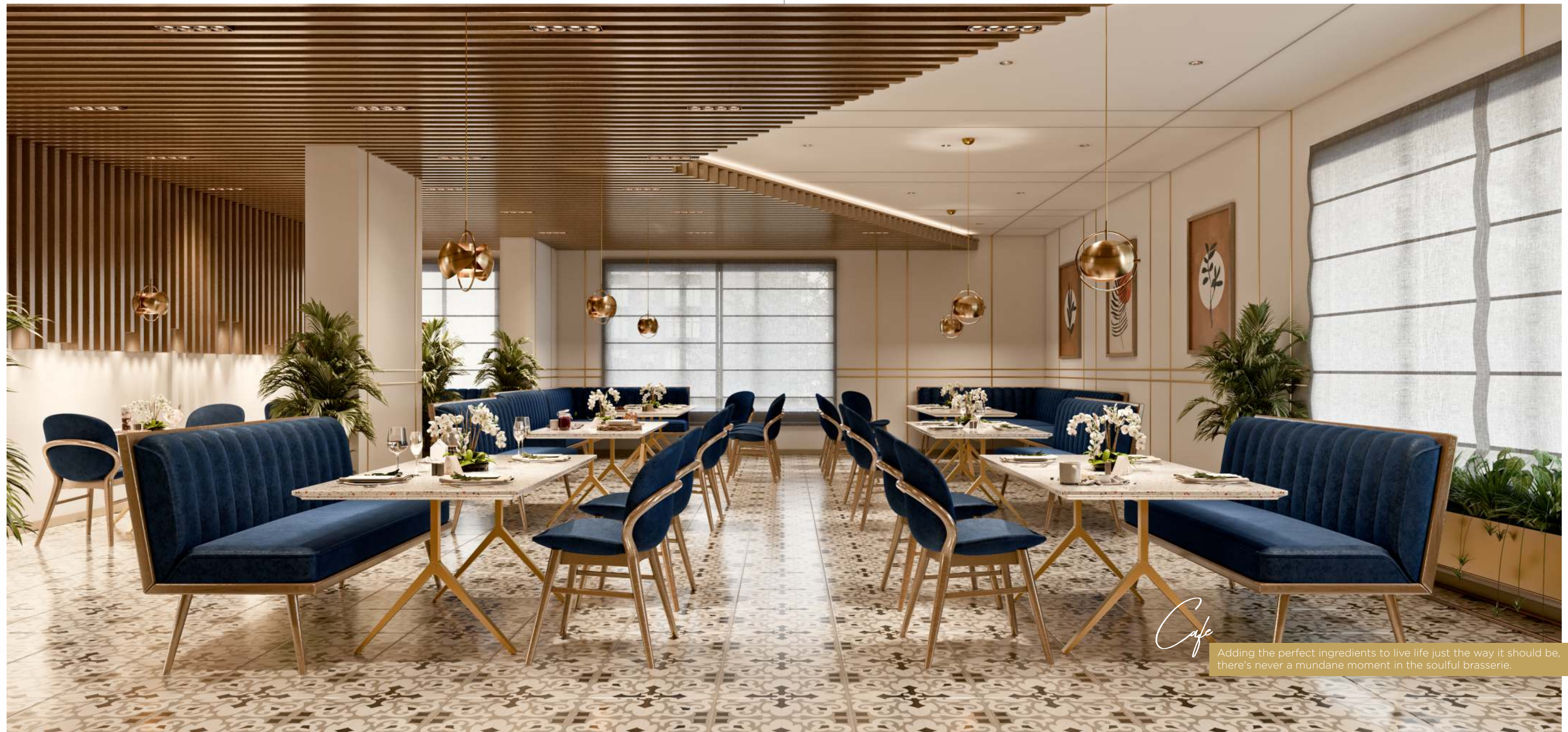
* Artistic Impression