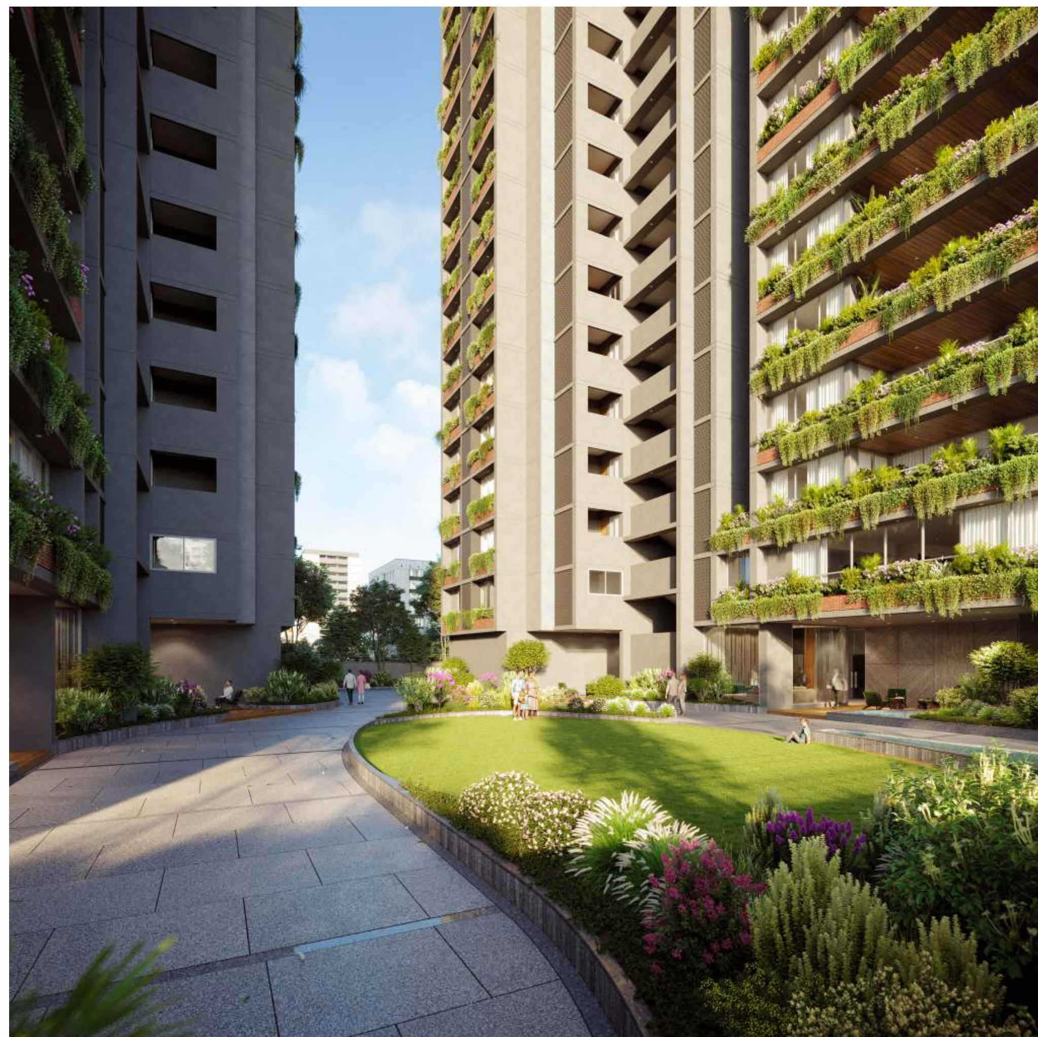
* Artistic Impression