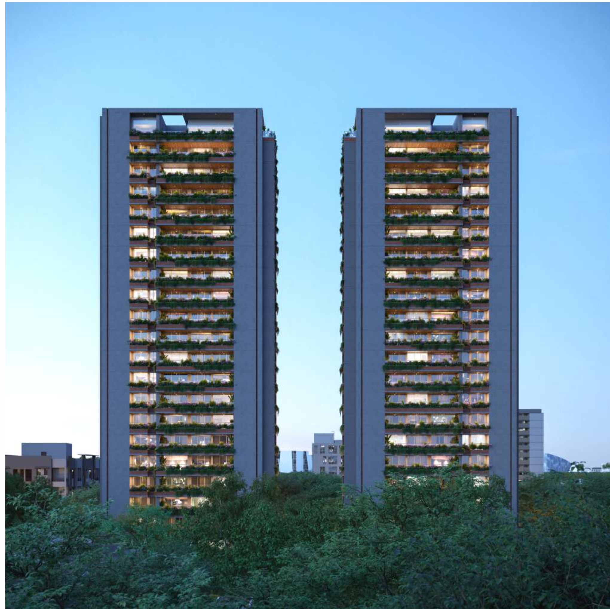
* Artistic Impression