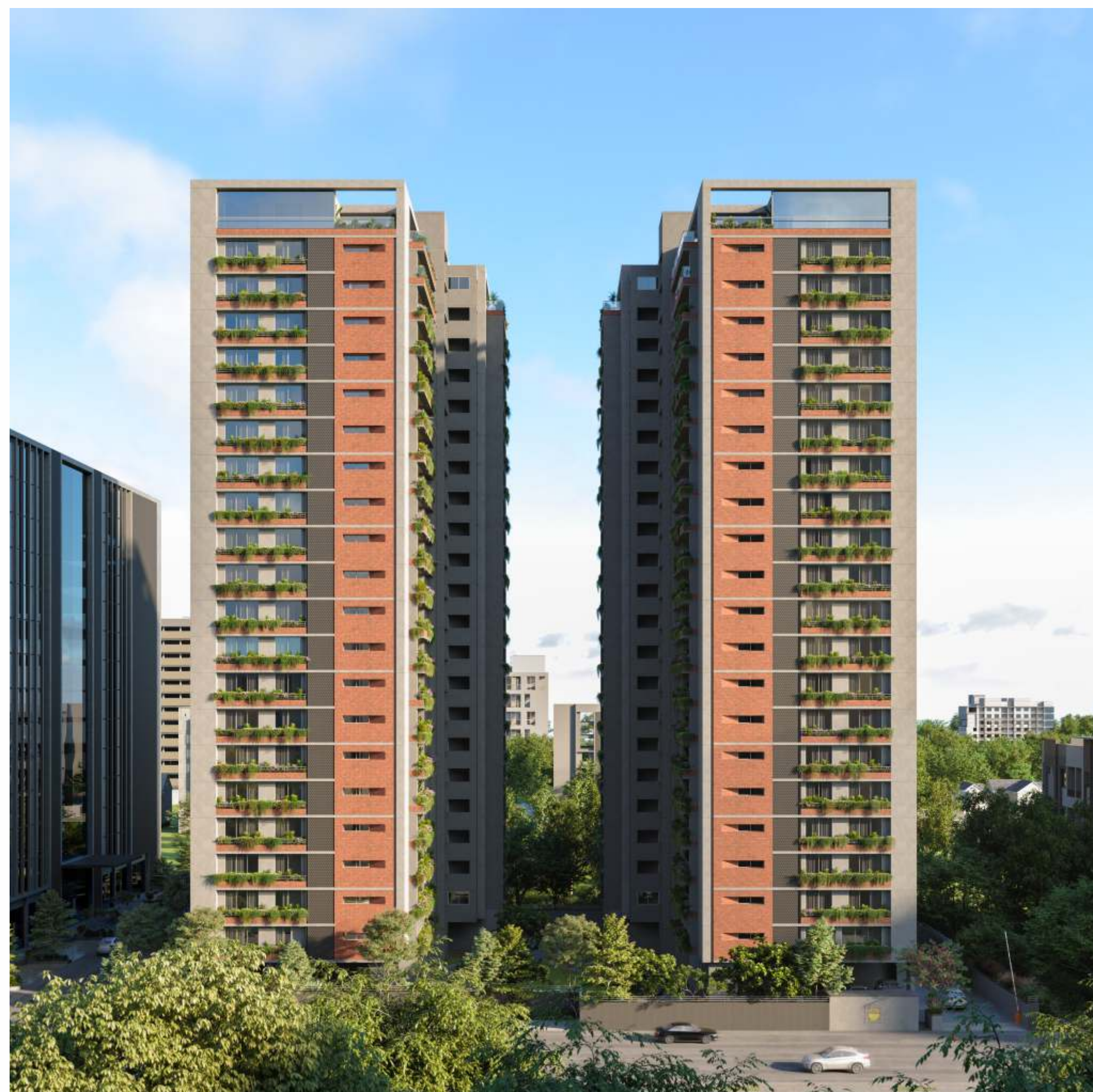
* Artistic Impression