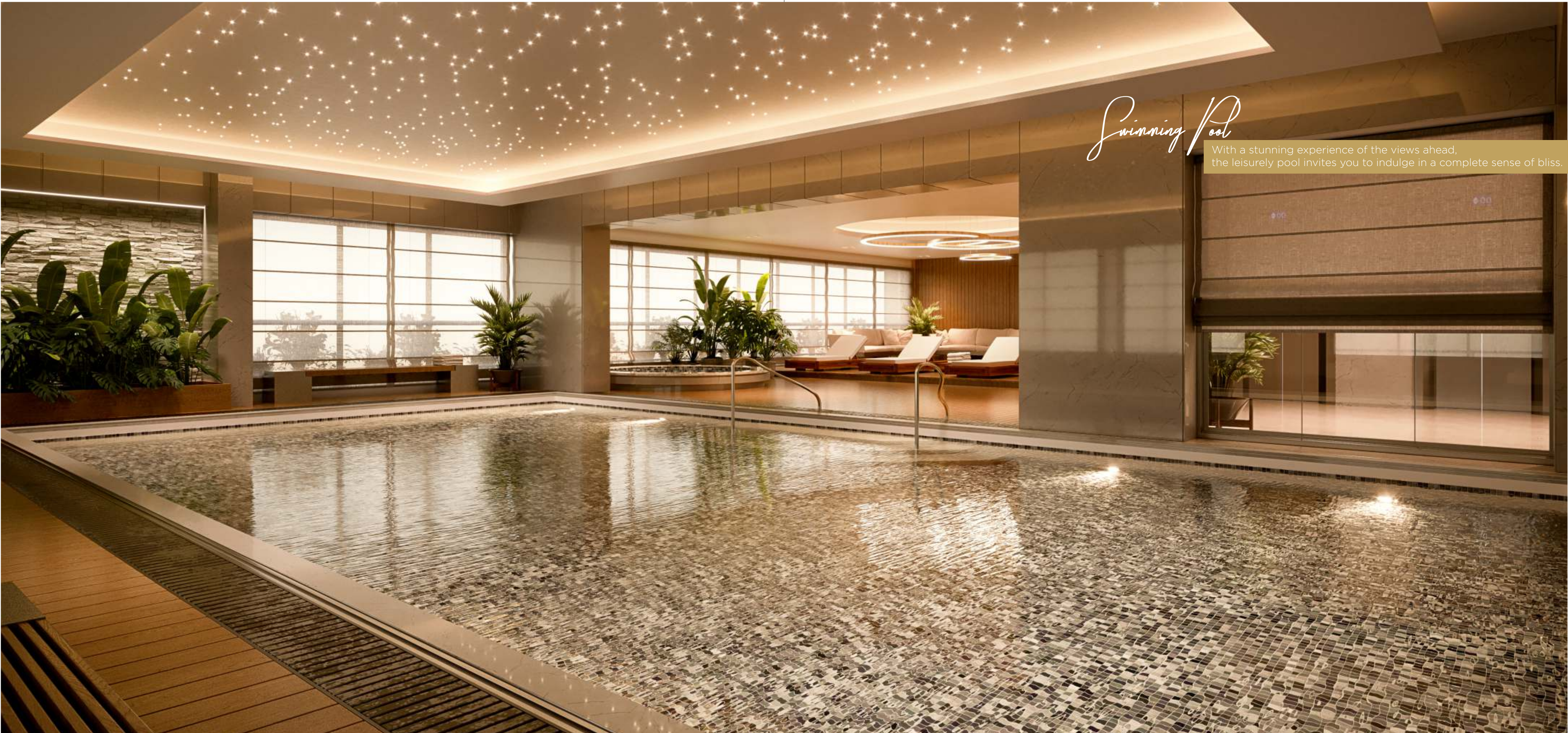
* Artistic Impression

With a stunning experience of the views ahead, the leisurely pool invites you to indulge in a complete sense of bliss.