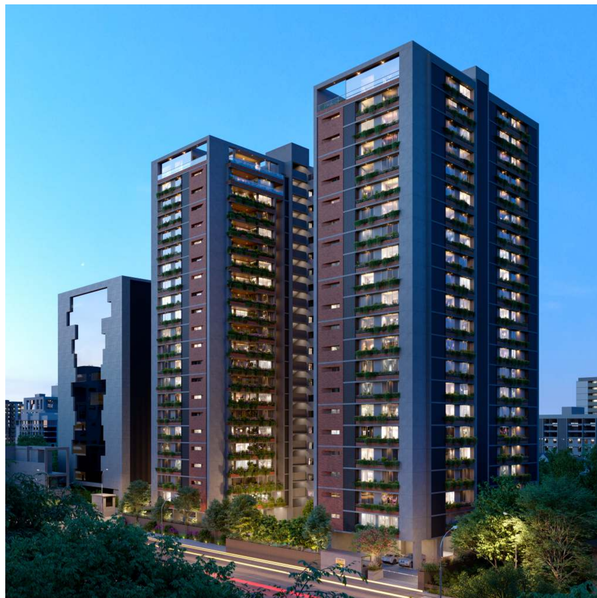
* Artistic Impression