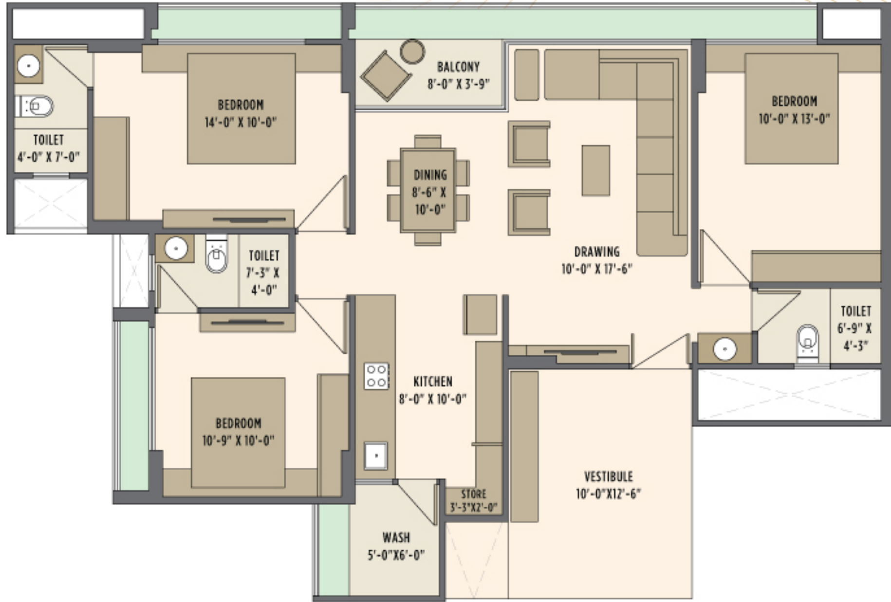
UNIT PLAN : TYPE-1 3BHK