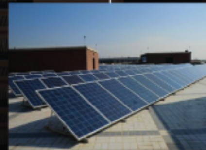
Solar panels for common use