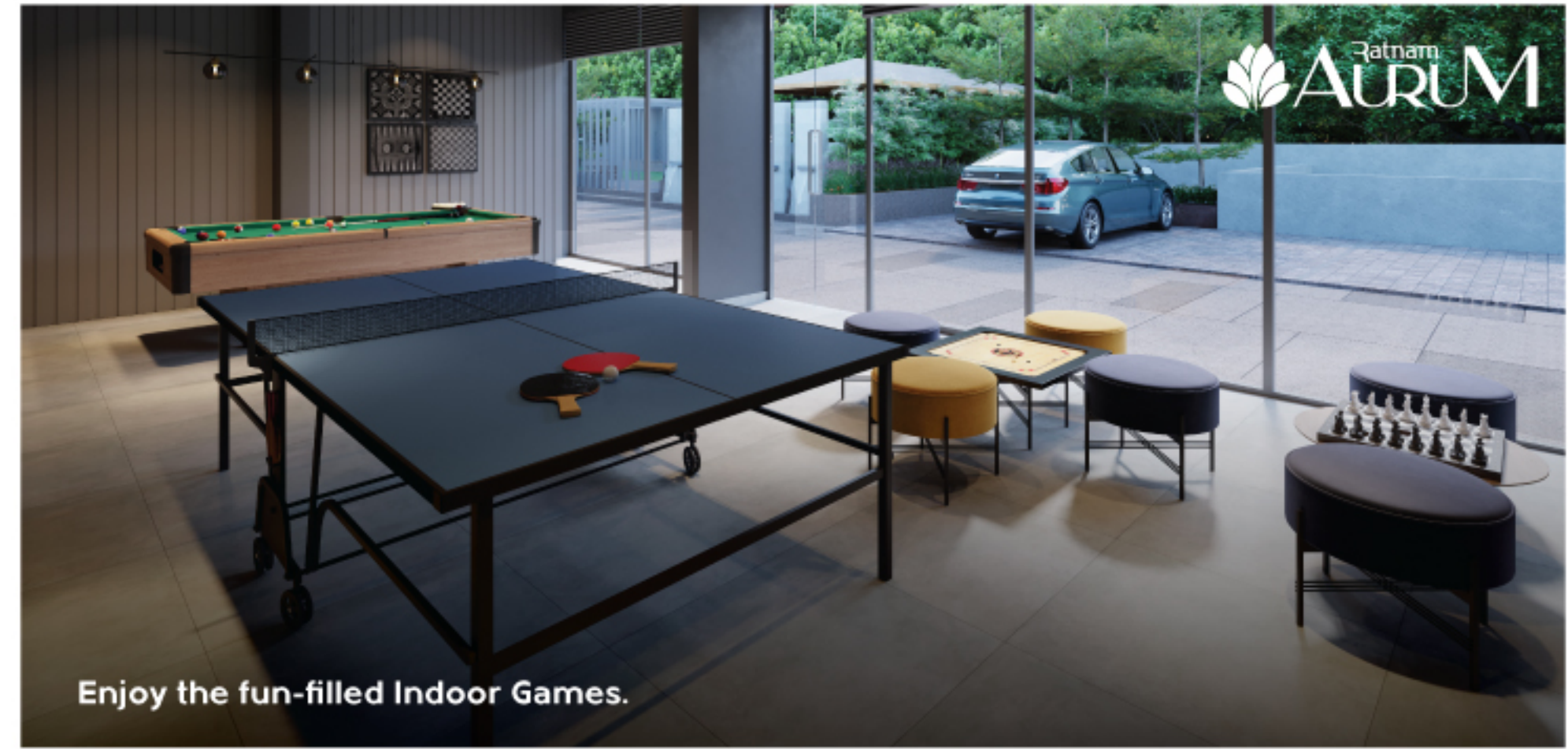
Enjoy the fun-filled Indoor Games.

Main door - Wood-framed & laminated modular/flush doors Other doors - Front & back painted & wooden modular/flush doors. Aluminum-powered coated windows with granite frame sills.