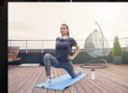
Yoga/Meditation floor area