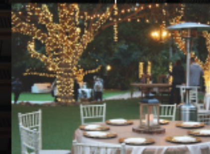
Party/function artificial lawn area