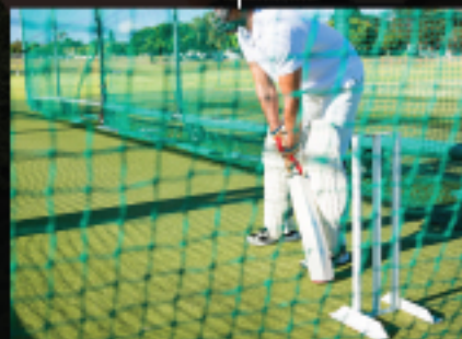
Box cricket pitch