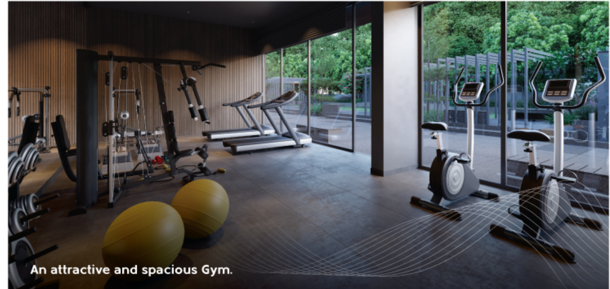
An attractive and spacious Gym.