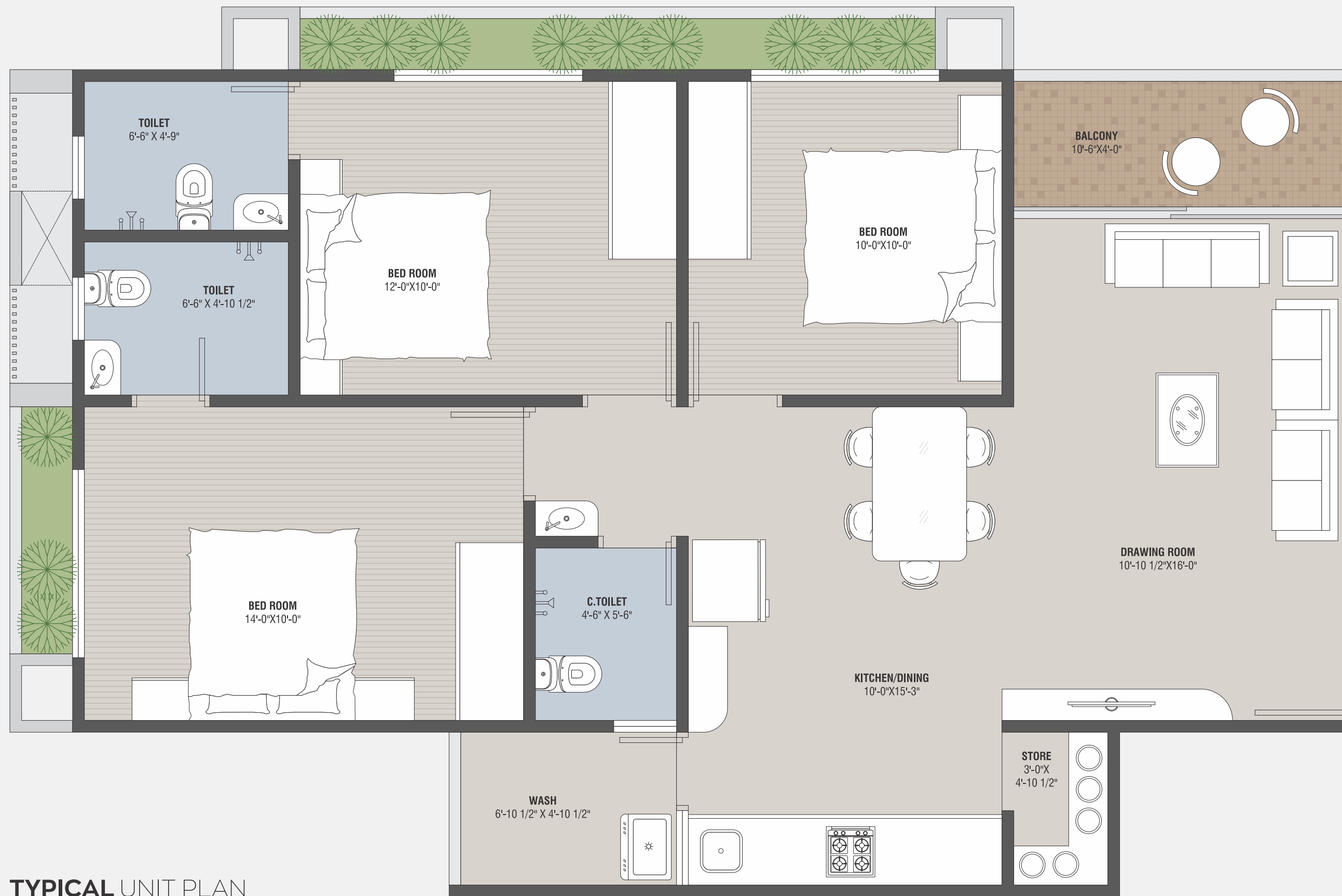
TYPICAL UNIT PLAN